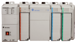
Allen-Bradley CompactLogix Programmable Automation Controller