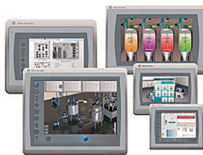
Allen-Bradley PanelView Plus 7 Graphic Terminal