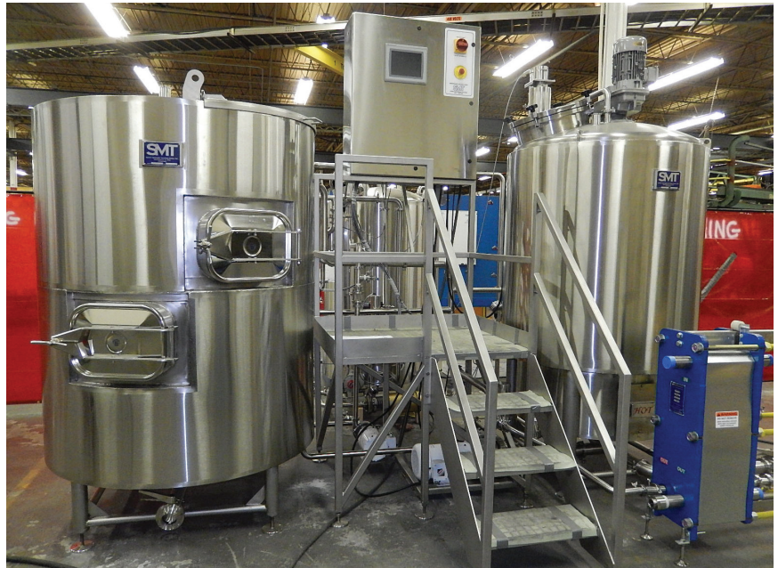
The fully-automated craft brewing system from SMT takes advantage of the latest graphics, touch-screen and mobile technology.

When it comes to microbreweries, one thing is certain: no two are alike. And while there is a degree of standardization to the brewing process, equipment suppliers must customize installations to meet unique layouts and system parameters – and anticipated production demands.